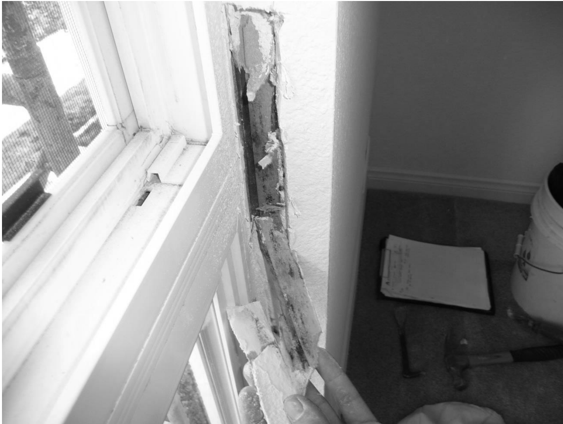
Figure 3A – Vertical Mullion Failure

the joints between fins. Even if individual windows are tested and deemed successful, if the mullied window is not tested as an assembled unit, it can be susceptible to failure at the mullied joints from the lack of windows' welded fins. Many manufactures and builders fail to test windows in the actual mullied configuration, resulting in water and air intrusion issues down the line.