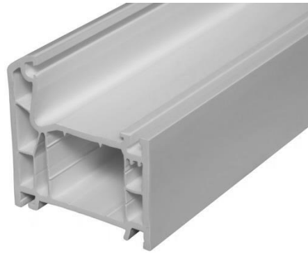
Figure 1C – Vinyl Windows