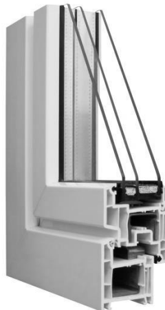
Figure 1A – Vinyl Windows

Windows are one of the most complex and expensive facets of the building envelope as they can account for approximately 10% of a building's air infiltration according to the U.S. Department of Energy, and can cost up to several thousand dollars per unit. The number, size, material choice and orientation of windows can make or break the energy efficiency of the entire building. With so much on the line, it is important for windows to be weather and water tight. There are slightly less than 100 different American Society for Testing and Materials (ASTM) tests and 40 American Architectural Manufacturer's Association (AAMA) standards, in addition to various other NFRC, ANSI, ASCE, CPSC, NFPA, UL and GANA Standards pertaining solely to windows. One of the most specified glazing products in multi and single family construction is the vinyl window.