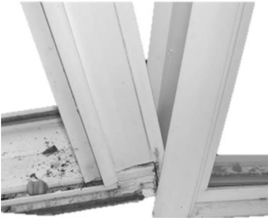
Figure 2A – Common Window Failures

Vinyl is a relatively flexible material making it weak in bending strength. vinyl windows in a larger size are generally not available since the frame lacks the stiffness and rigidity to support a large piece of glass. They are more effective for smaller windows, but sometimes longer span vinyl frames are reinforced with steel to reduce bending and bowing of the frame, which can result in reduced thermal performance. Flexibility and excessive bending make it more difficult for sealants and glazing gaskets to uniformly and effectively attach resulting in air leaks and water infiltration, as shown in Figure 2A. Vinyl window mullions are not as strong as aluminum therefore, larger mullions are required to span the same sized window as compared to aluminum or steel. To overcome the lack of larger vinyl windows, often several windows, usually 2 to 3, are mullied, or joined together, to form a larger window.