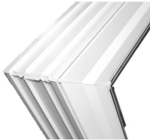
Figure 2B– Common Window Failures