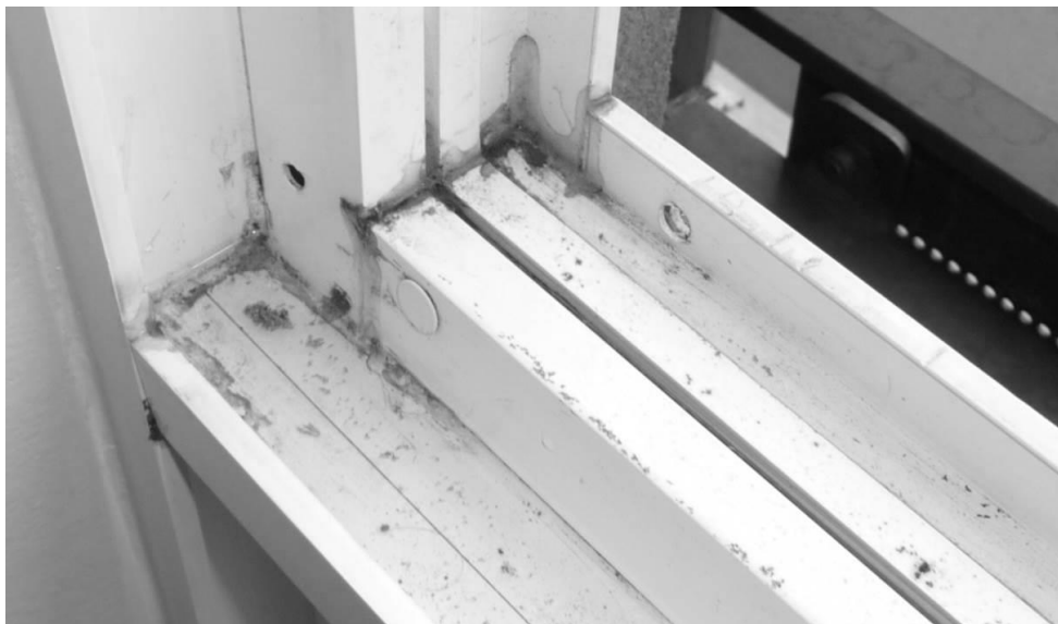
Figure 4A – Coped Mullion Joint Failure

During testing water rushed into the lower frame via the horizontal track which then percolated into the dry sill track and then overflowed onto the wood stool. A fixed “dry” sill track does not provide drainage, leaving no method of managing the water that enters the frame. The water leakage led to rusting of the structural steel reinforcing and buildup of standing water in the lower sill track resulting in growth of mold, mildew, rust, and damaged wood stools. This water intrusion was due to improperly sealed horizontal to vertical coped mullion jamb extrusion joints which allowed water to flow through the sealant-dependent joint in the horizontal mullion into the lower sill track.